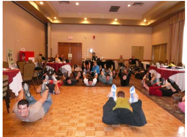
Internal Medicine Residents at the Annual Residents Retreat practicing yoga as part of their retreat theme: "Life Balance"