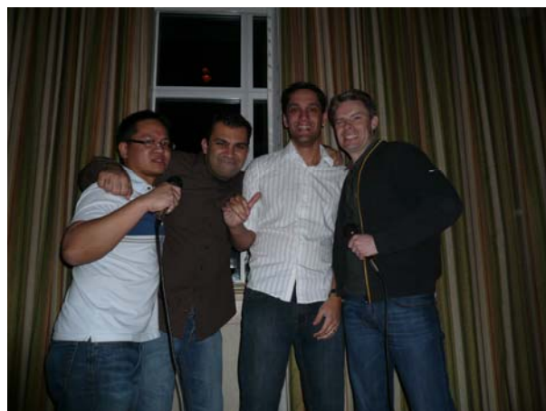
Internal Medicine residents enjoying some fun time at the Annual Residents Retreat Dinner and Karaoke night