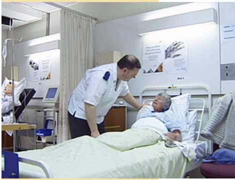
Caring for a patient with a fractured hip